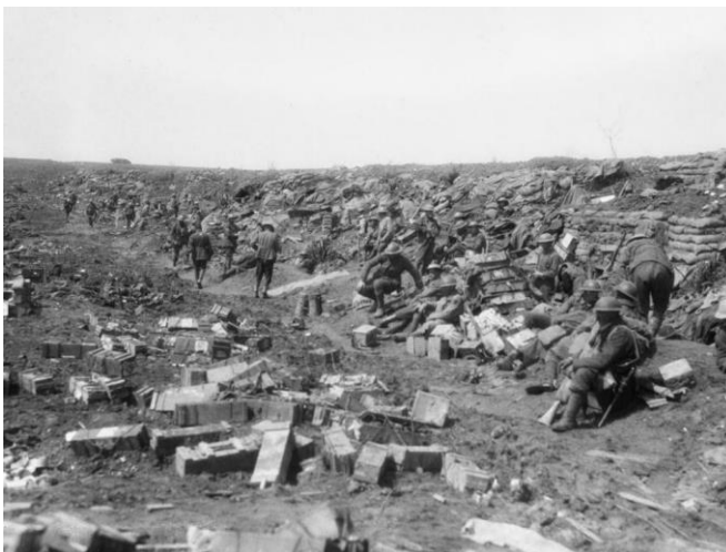
Australian lines at Bullecourt, April 1917.