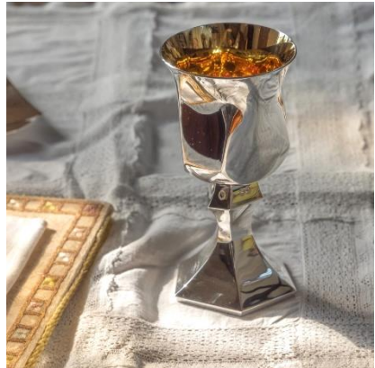
The new chalice