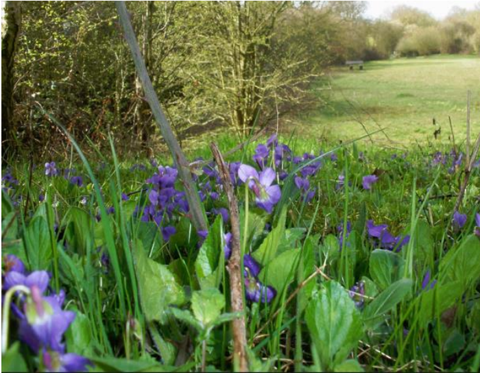
Spring violets at the Bourn/Kingston Old Railway Local Nature Reserve.