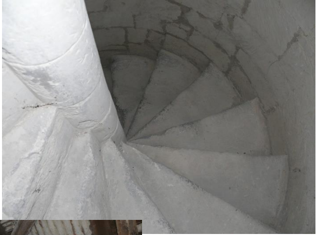
Church Tower Stairs