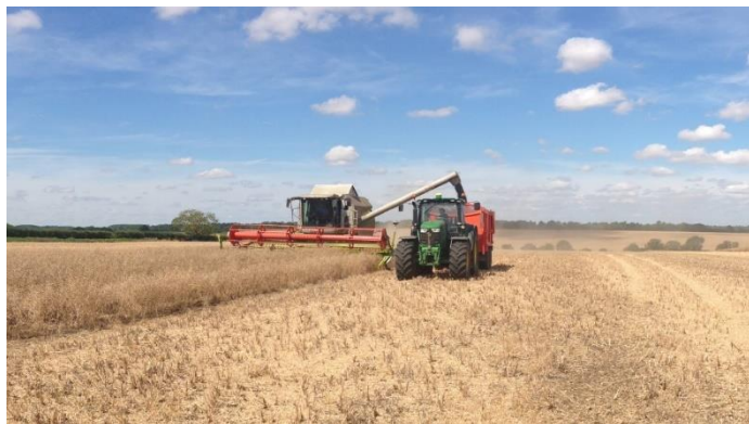
Harvesting the Fields