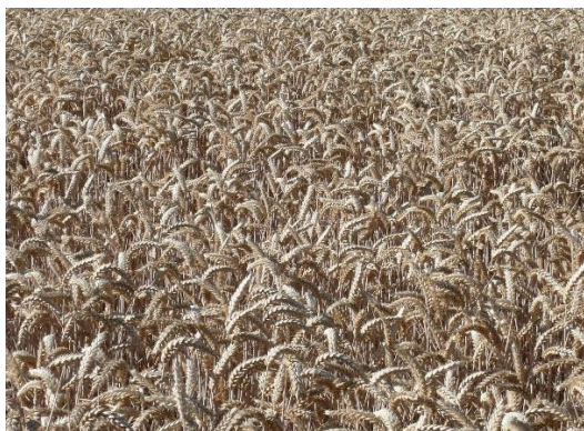
Harvesting the Gardens