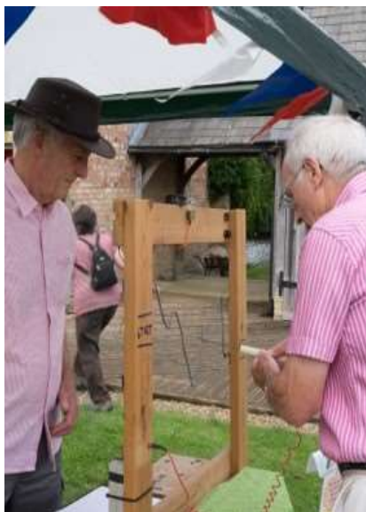
A study in concentration!