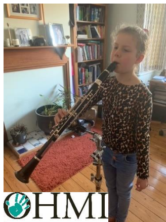
Music-Making for People with Physical Disabilities

Bourn Players are delighted to support this wonderful charity. City of Angels is being performed at Comberton Village College Performance Hall on 14, 15 and 16 March. Don't forget to buy your tickets to the show by going to our website www.bournplayers.org.uk