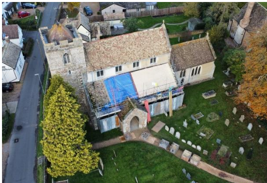
Roofing of south aisle in progress 10.11.2023

due to attend to clean and repair the chancel arch wall painting whilst the scaffolding remains in situ. The roofers have had to contend with a lot of wet weather but more than half of the south aisle has been finished. The PCC now has about 2,000 reclaimed peg tiles to sell: is anyone interested?