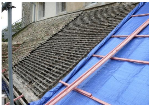
Above: Old tiles and battens