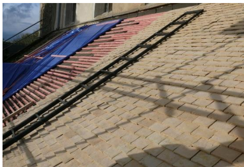
Right: New Burwell clay peg tiles

All Saints and St Andrew's Church warmly invites you to the Christmas Services