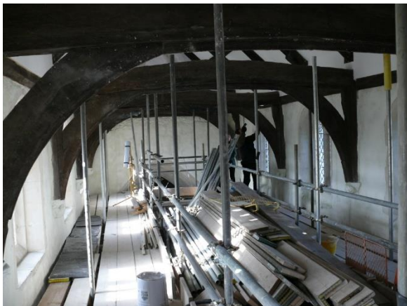
Inspection for bats:

Because the works were going beyond Natural England's deadline of 7 th November, the PCC was obliged to commission a bat survey which was carried out by greenwillows associates, of Warboys, on November 6 th : they found plenty of evidence of bats in the church, but their assessment was that we weren't causing any undue disturbance to them. As we go to press, the date for completion of the works is November 24 th , but there have been further delays and it is likely to be the week following before everything is concluded.